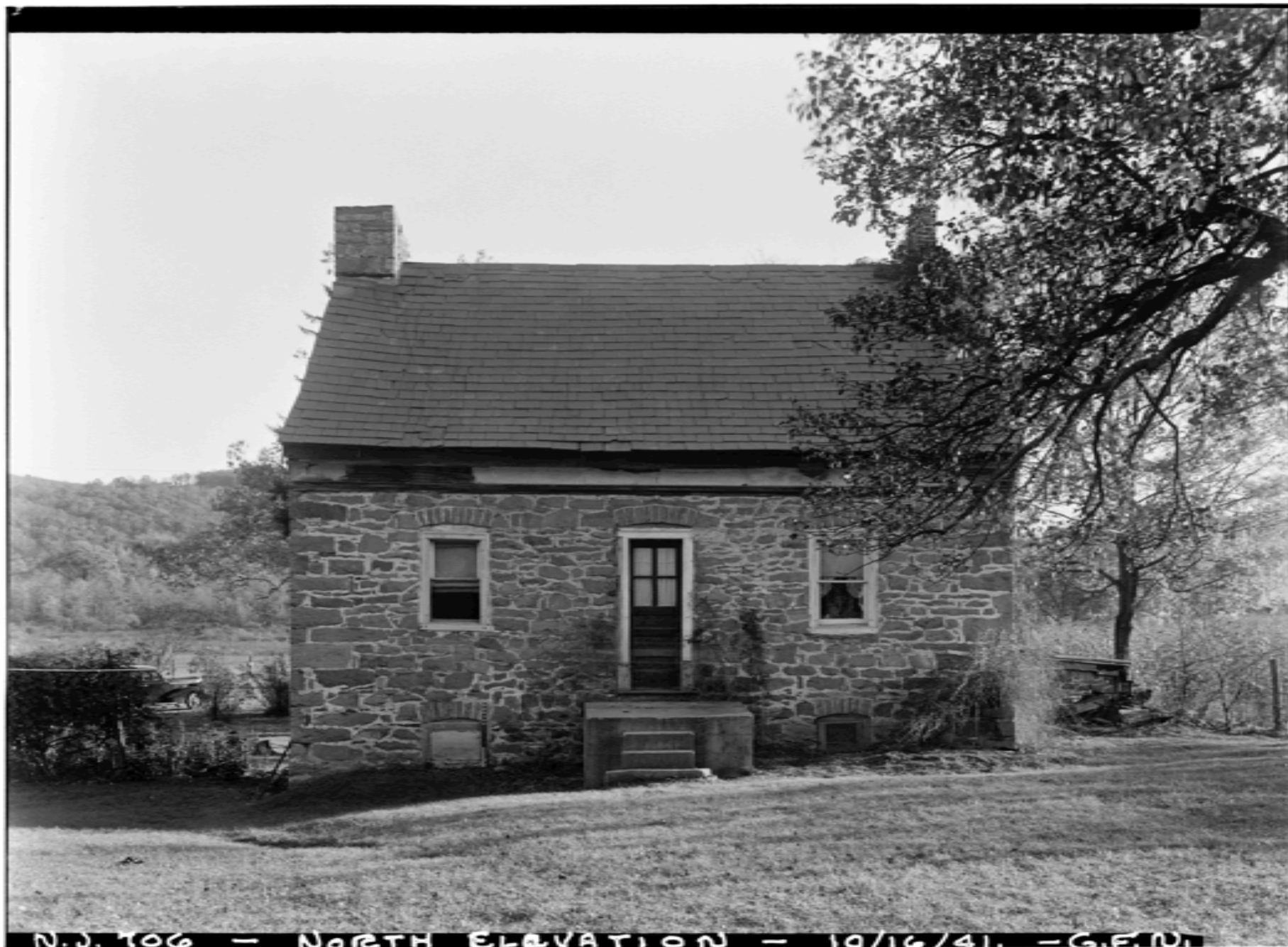
N.J. 706 - NORTH ELEVATION - 10/16/41 - G.E.D.