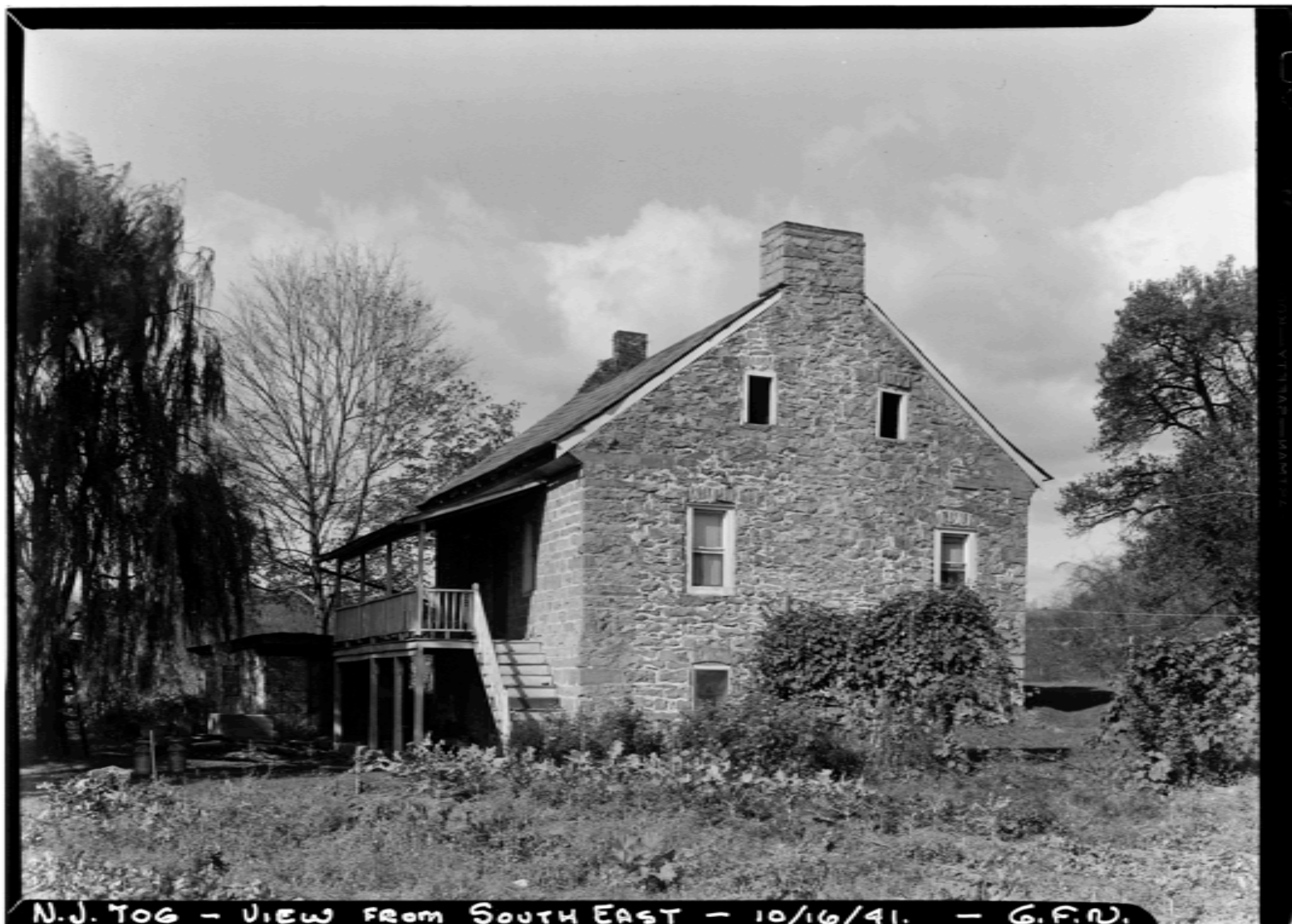
N.J. TOG - View from South East - 10/16/41. - G.F.N.